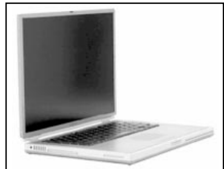
Steven Jobs: "Oh there's one more thing..." Apple's new PowerBook G4

We were almost done when, in standard Steve Jobs fashion, he simply states, "Oh there's one more thing..." Apple's new PowerBook G4. Totally redesigned, this will make even the most diehard PC person go, "I want one!". They include a 5.3 hour battery, 15.2 inch mega wide screen, built-in FireWire, USB, Audio I/O, SVGA and composite video out, 56k modem, 10/100 Ethernet, infrared, PC card slot, AirPort wireless ready, a 400 or