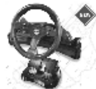
Nascar Pro Digital Wheel

Digital Steering wheel with pedals included!