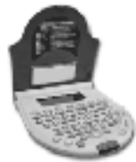
Databank With FM Radio