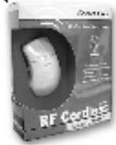
RF Cordless Mouse