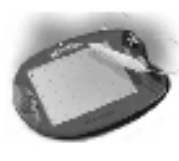
Learn And Sketch

Tracing cards, ABC's and 123's included!