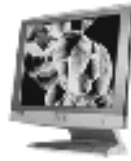
KDS RAD-5P LCD Monitor

15" LCD flat panel monitor with 3 yr warranty